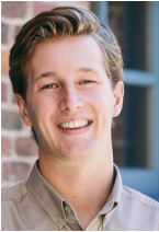
Atlantic Branch Lincoln Esau Irving Pulp & Paper