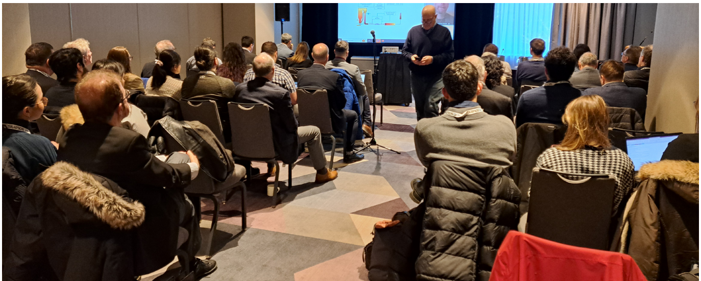
PaperWeek 2024 Session room in Montreal