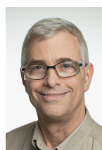
Mechanical Pulping George Court Irving Paper