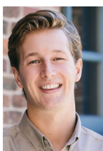
Atlantic Branch Lincoln Esau Irving Pulp & Paper