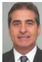
Paper Machine Technology Sammy Di Re Voith Paper