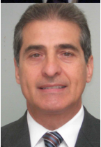
Paper Machine Technology Sammy Di Re Voith Paper