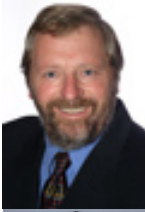
Process Control Michel Ruel Top Control Inc.