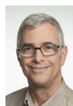
Mechanical Pulping George Court Irving Paper