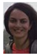
Bleaching Honey Nampak Harmac Pacific